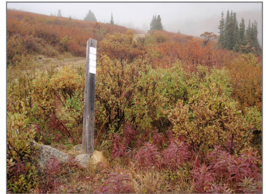
An old mining claim-post in the Spruce-Willow-Birch zone northeast of Atlin, B.C.