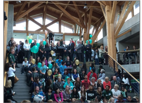
The UNBC community gathering for the official 25th Anniversary Kick-Off

We started it on a high note, with the successful UNBC 25th anniversary kick-off on Tuesday! NRESi participated in the event through its organizing of the ceremonial tree, as well as planting more than 100 seedlings on campus as a part of our bigger planting project honouring UNBC's 16,000 petition signers (to take place next spring). Big thanks to all of the volunteers who helped, I couldn't have done it without you! Have a look at some of the photos from the day, through this link . We had a lot of fun! If you are on Facebook, while you're there 'Like' us to stay updated on all the latest NRESi news, events and announcements! You can find our page here .