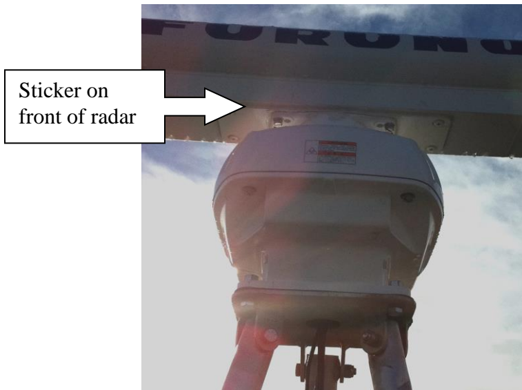
Figure 1. Image of sticker indicating front of radar that should face north.