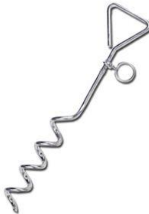
Figure 3. Image of a dog leash anchor used to secure the dry wall lift to the ground