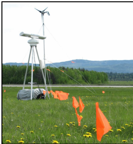
Figure 6. Radar with red flags lining extension cord and tarp covering pelican case.