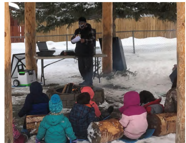
Above: Khit/Khui (Winter) Festival Photos