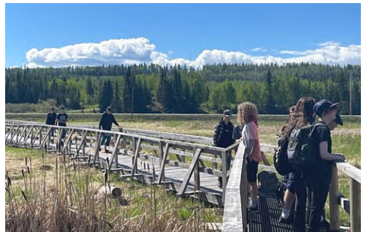
Above: Grade 8 students from NVSS visiting the Redmond Wetland, May 2021