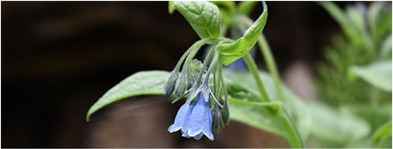
Above: Flower near Murray Creek

Transforming education by connecting students, communities, and waterways