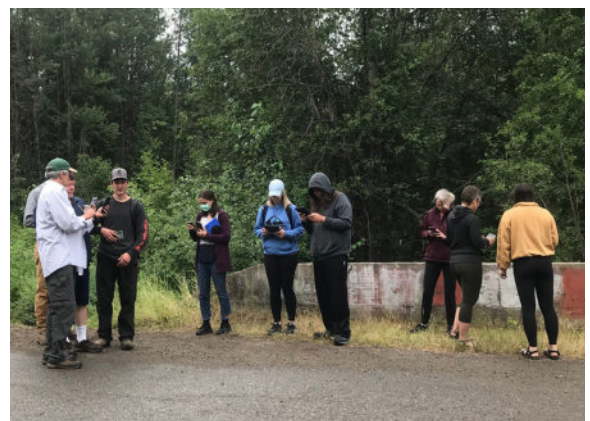
Below: Participants trying out geospatial apps at the Portal Workshop in Fort St James