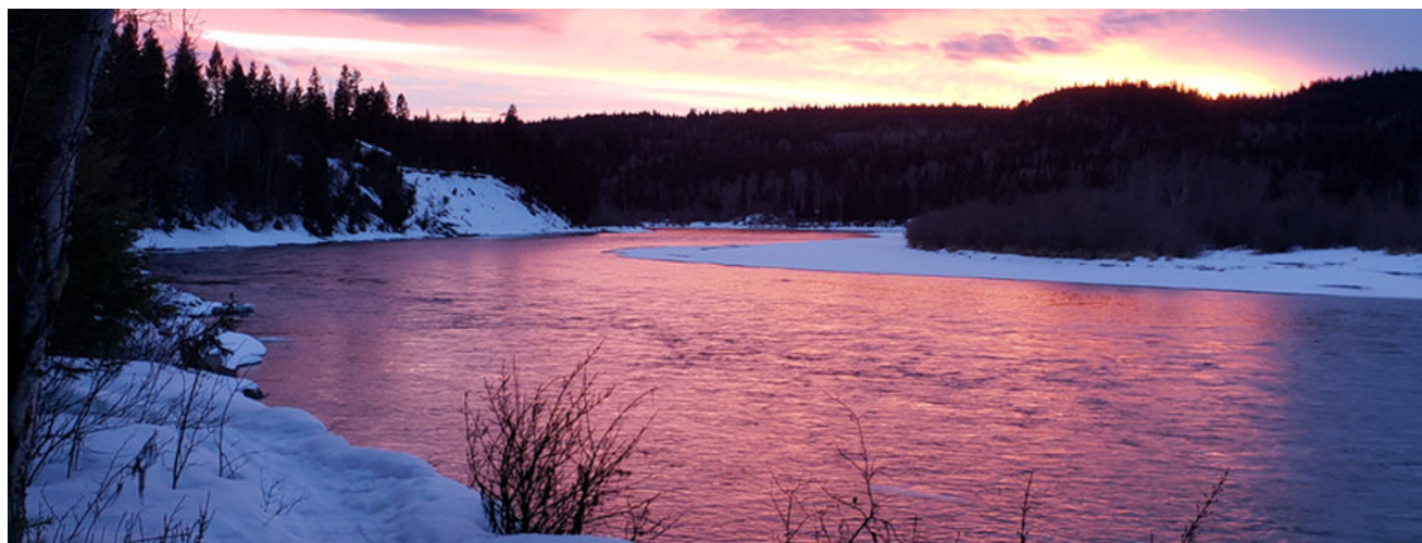
Above: Nechako river

Transforming education by connecting students, communities, and waterways