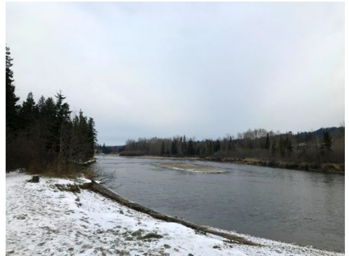
Above: Nechako River.

On February 23, UNBC's Integrated Watershed Research Group (IWRG) hosted an "Evening on the Nechako" to share the latest developments of their research in the Nechako watershed. The evening featured a presentation by IWRG researchers, conference-style poster presentations by graduate students, and opportunity for discussions and dialogue between participants and presenters.