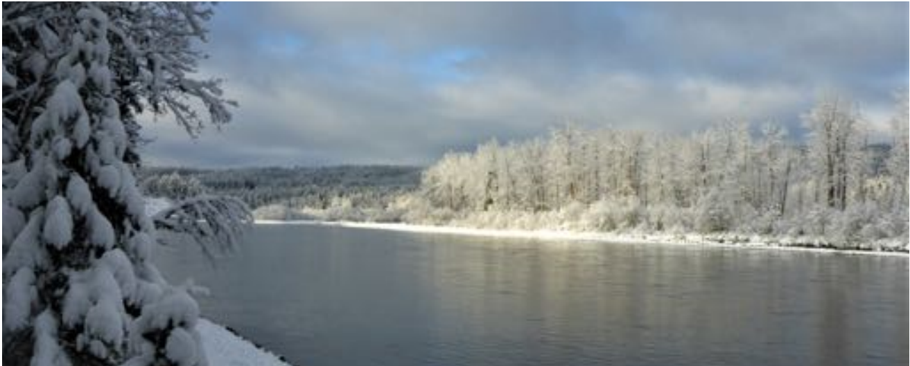
Above: Nechako River.