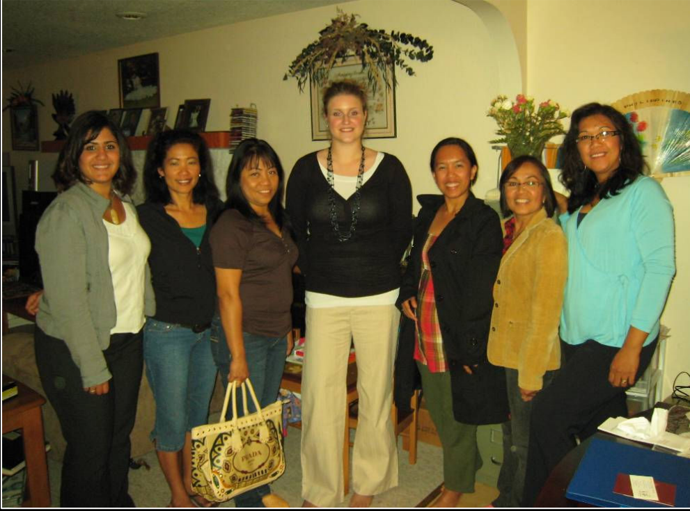
Permission from participants