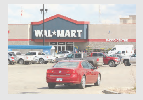
The Dawson Creek Walmart is being converted into a Supercentre as early as later this year. A7