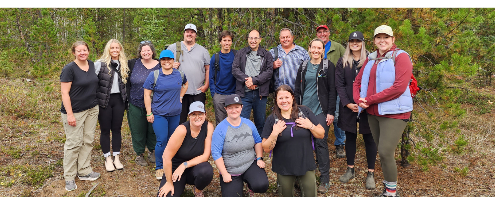
Image: The RCCbc Northern Node at an outdoor skills building retreat