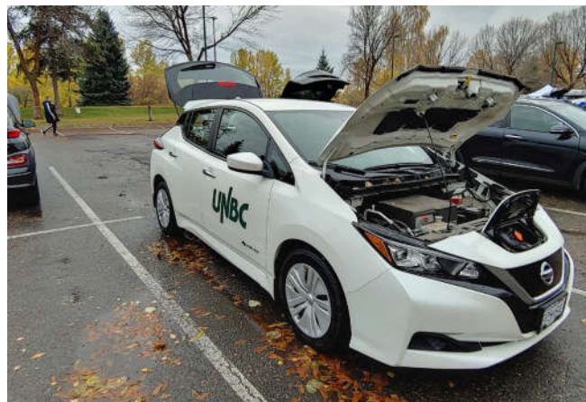
Figure 4: UNBC at the 2021 Prince George Electric Vehicle Experience Event