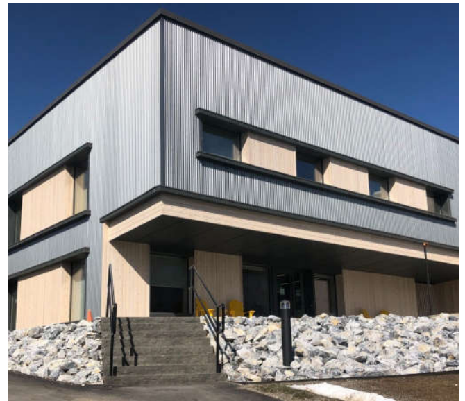
Figure 1: Facilities Management Building

Another important success in 2021 has been the more consistent operation of the Bioenergy Plant after recent maintenance issues. Since it began operating in 2011, the Bioenergy Plant at UNBC (Figure 2) has been the most important factor in reducing emissions, supplying up to 85% of the peak heating demand of the Prince George campus, which otherwise would be supplied by combustion of natural gas. Through both the Bioenergy Plant and the smaller Pellet Boiler that supplies