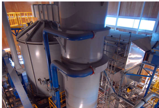
Figure 2: Bioenergy Plant

Fleet emissions in 2021 represented approximately 2% of total emissions. The size of the fleet reduced from 30 vehicles in 2020 to 28 vehicles in 2021. There are only five non-research fleet vehicles, one of which is a fully electric Nissan Leaf that is used by the Facilities Department. The Nissan Leaf is the main light-duty vehicle for travelling on the main campus and within Prince George. It is expected that fleet travel would have also decreased due to the COVID-19 pandemic and the increased use of communications technology to carry out virtual meetings instead of physical site visits.