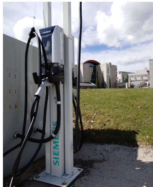
Figure 3: Level 2 Electric Vehicle Chargers

As fleet vehicles are replaced, UNBC will review alternative zero emissions options where feasible in order to further reduce fleet emissions, as was done successfully in the case of the Facilities Nissan Leaf. This will require collaboration between departments including the user groups and Procurement, and will likely take the form of a zero emissions fleet procurement policy, setting out a standard process for fleet vehicle replacement that prioritizes zero emission vehicles. There are already opportunities being identified wherein zero emission vehicles may be a viable replacement for certain vehicles reaching end of life. It should be noted that the majority of fleet vehicles are research vehicles that tend to travel to remote locations and typically need to be able to store and tow heavy equipment, as well handle rough terrain. The improvement of charging infrastructure in remote areas and increased availability of affordable zero emission vehicles that can meet these requirements will be important in enabling a faster conversion to a zero emission fleet. In addition, with the increasing adoption of electric vehicles by the UNBC community and anticipated increase in electric fleet vehicles, further planning will be carried out on the long term strategy for charging electric vehicles on campus.