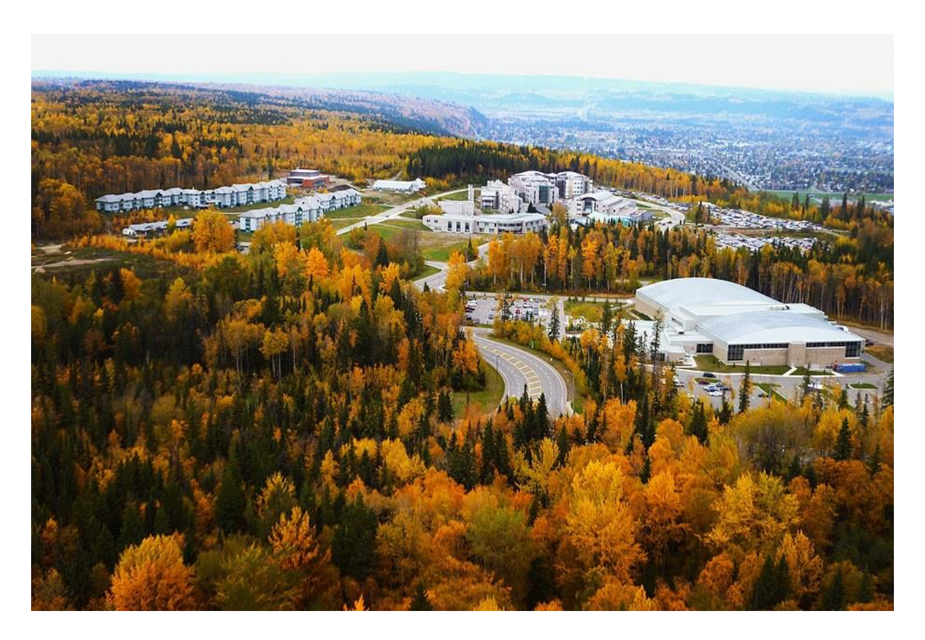
Fall 2022 - UNBC CTLT Newsletter

The UNBC Centre for Teaching, Learning, and Technology (CTLT) works with programs, faculty, instructors, and teaching assistants to support, enhance and celebrate the excellent teaching and learning taking place at UNBC. Our newsletter is published each semester to highlight & celebrate examples of high impact teaching practices underway at UNBC.