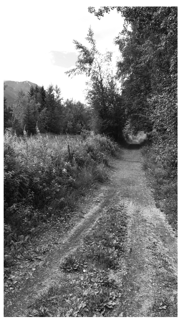
Smithers, BC, July 2018