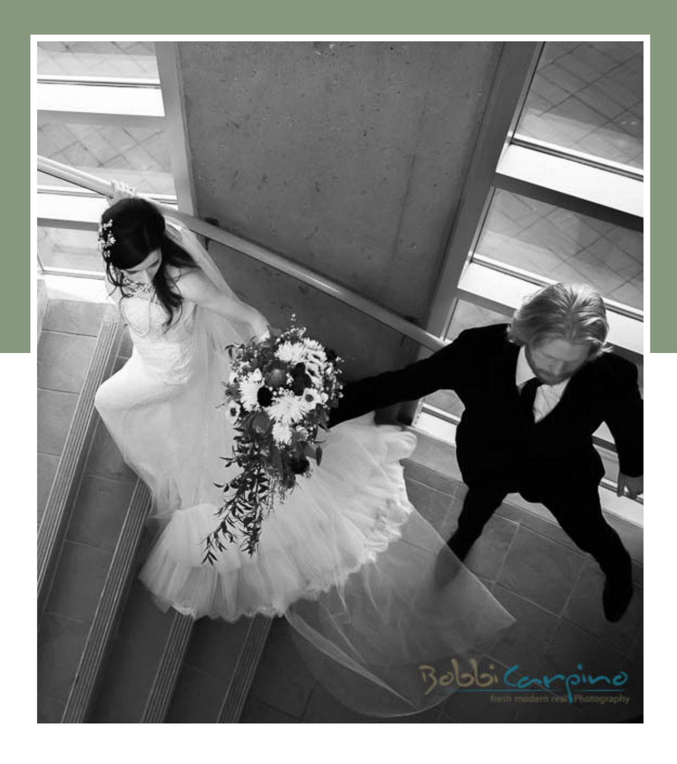
Contact us today!

3333 University Way, Prince George, B.C.