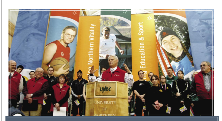
April, 2005 - Premier Gordon Campbell announces government funding for the NSC.