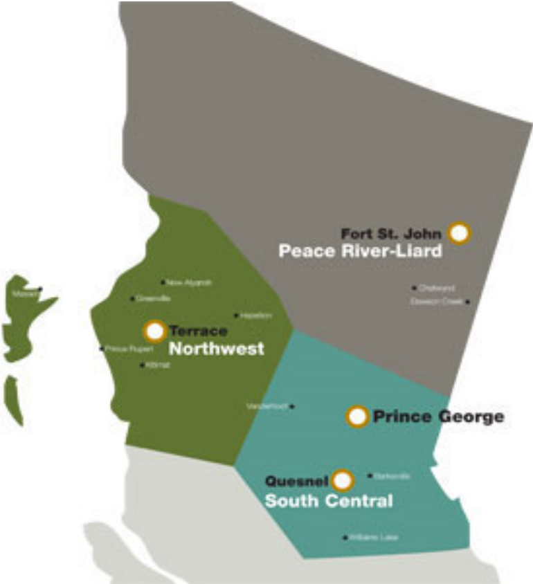
Regional Campus Map