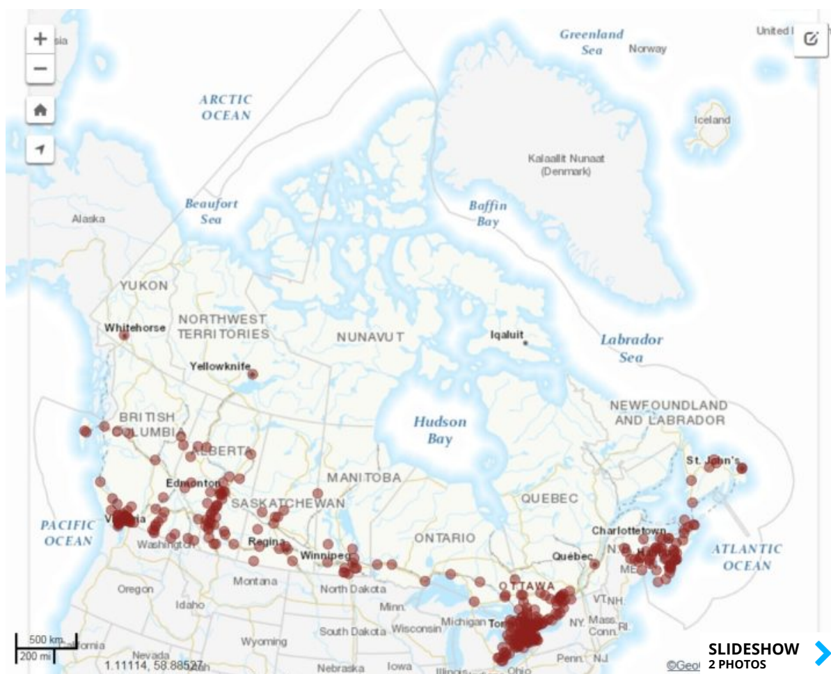
Destination communities for Syrian refugees who have arrived in Canada.