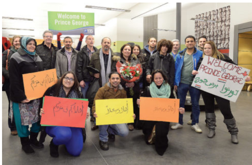
Welcoming the first Syrian refugee to Prince George.

Groups of five or more individuals and organizations can opt to sponsor refugees through various government-managed programs. Once approved, the sponsorship group is responsible for supporting the refugees during their first year in the country. This usually includes paying for food, housing, clothing, and other day-to-day expenses; helping with access to education and language training; providing assistance with finding a doctor and navigating the health care system; offering an orientation to activities such as banking and transportation; and assisting with job searches. The ultimate goal of the PSRP is to assist refugees to become self-sustaining, independent permanent residents of Canada. The program is also seen as one of the key channels for refugee resettlement outside of major urban centers.