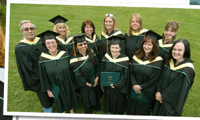
These Bachelor of Social Work grads completed their coursework in Quesnel.