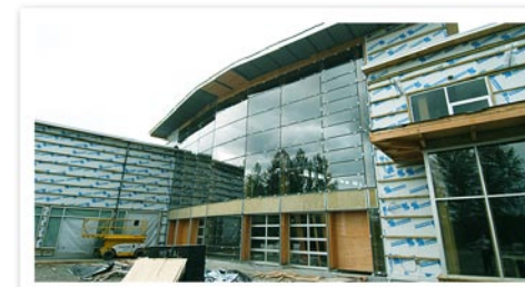
The new CNC / UNBC Campus in Quesnel