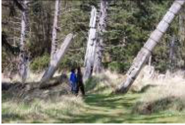
2009 Field Course to Haida Gwaii

In April/May, I ran a field course on the linkages between sustainability, community development, aboriginal tourism, and protected areas on Haida Gwaii. This course thematically followed along from the spring course I offered in 2008 and was run in conjunction with a physical geography course offered by