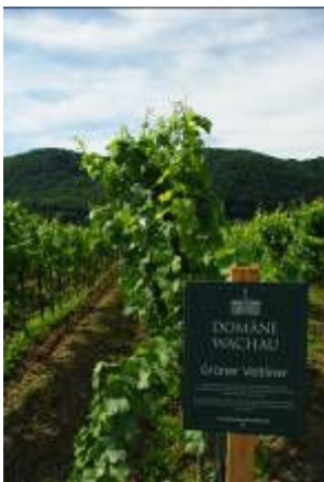
Vineyard in the Wachau Region, Austria

For my adrenaline fix, I also went on a few short paragliding trips in the Fraser Valley as well.