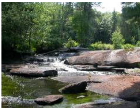
Rapids on the Whitestone River in Ontario

Now that fall is here I'm back to teaching and administration. Stop by and see me in 8-144!